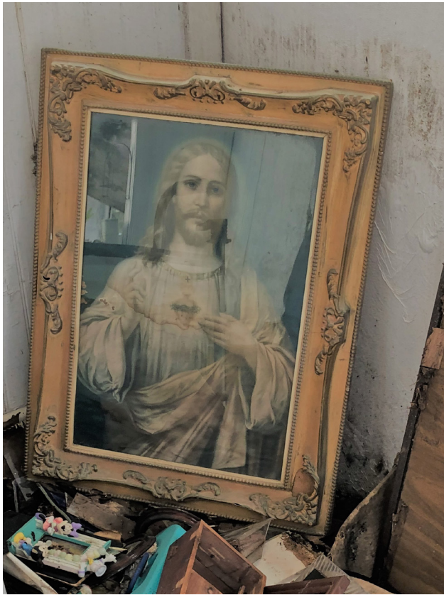
Photo in a flooded home in Anasco, Puerto Rico. Presbyterian Disaster Assistance Mission Trip.

Now Peter was sitting outside in the courtyard. One of the maids came over to him and said, “You too were with Jesus the Galilean.” But he denied it in front of everyone, saying, “I do not know what you are talking about!” As he went out to the gate, another girl saw him and said to those who were there, “This man was with Jesus the Nazorean.” Again he denied it with an oath, “I do not know the man!” A little later the bystanders came over and said to Peter, “Surely you too are one of them; even your speech gives you away.” At that he began to curse and to swear, “I do not know the man.” And immediately a cock crowed. Then Peter remembered the word that Jesus had spoken: “Before the cock crows you will deny me three times.” He went out and began to weep bitterly.