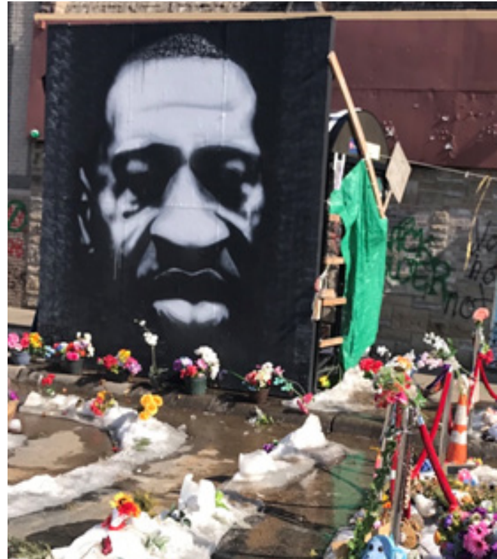
The Peoples memorial to George Floyd in Minneapolis, MN.