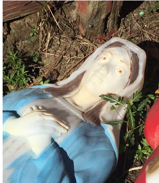
A statue of Mary found in the floods following Hurricane Harvey's destruction in Beaumont, Texas. Presbyterian Disaster Assistance Mission Trip.