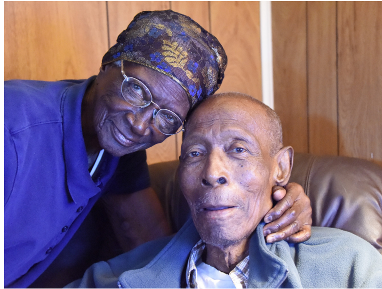
Survivors of Hurricane Matthew with major damages to their home. Presbyterian Disaster Assistance Mission Trip Johns Island, South Carolina.

The chief priests with the elders and the scribes, that is, the whole Sanhedrin, held a council. They bound Jesus, led him away, and handed him over to Pilate. Pilate questioned him, “Are you the king of the Jews?” He said to him in reply, “You say so.” The chief priests accused him of many things. Again, Pilate questioned him, “Have you no answer? See how many things they accuse you of.” Jesus gave him no further answer, so that Pilate was amazed.... Pilate, wishing to satisfy the crowd, released Barabbas, and handed Jesus over to be crucified.