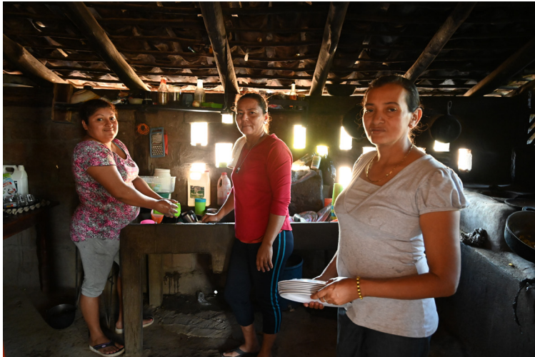
Cooking on a wood stove in a Nicaraguan village without running water. Village supported by CEPAD, Presbyterian International Partner.

When the chief priests and the guards saw [Jesus] they cried out, “Crucify him, crucify him!” Pilate said to them, “Take him yourselves and crucify him. I find no guilt in him.” ... They cried out, “Take him away, take him away! Crucify him!” Pilate said to them, “Shall I crucify your king?” The chief priests answered, “We have no king but Caesar.” Then he handed him over to them to be crucified. So, they took Jesus, and carrying the cross himself he went out to what is called the Place of the Skull, in Hebrew, Golgotha.