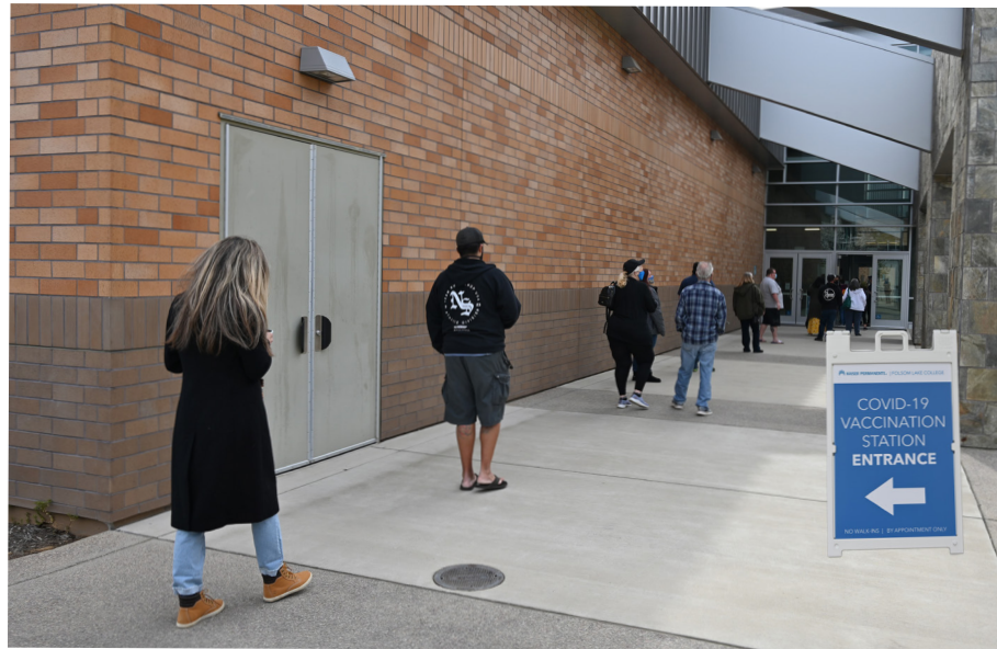
COVID-19 Vaccination Line in Folsom, California.