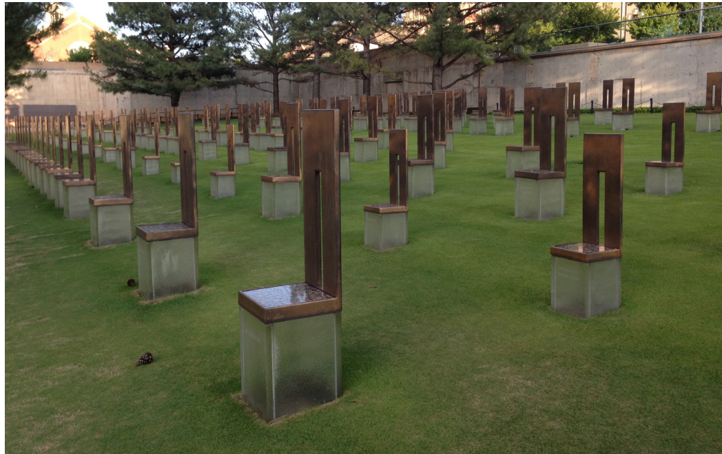
The memorial to those who died in the Oklahoma Bombing.