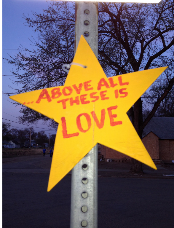
One of the hundreds of signs sent from the people of Joplin, Missouri to the Survivors of the flooding in Minot, North Dakota. Presbyterian Disaster Assistance Mission Trip.

While Jesus was still speaking, Judas, one of the Twelve, arrived, accompanied by a crowd with swords and clubs, who had come from the chief priests, the scribes, and the elders. His betrayer had arranged a signal with them, saying, “the man I shall kiss is the one; arrest him and lead him away securely.” He came and immediately went over to him and said, “Rabbi.” And he kissed him. At this they laid hands on him and arrested him.