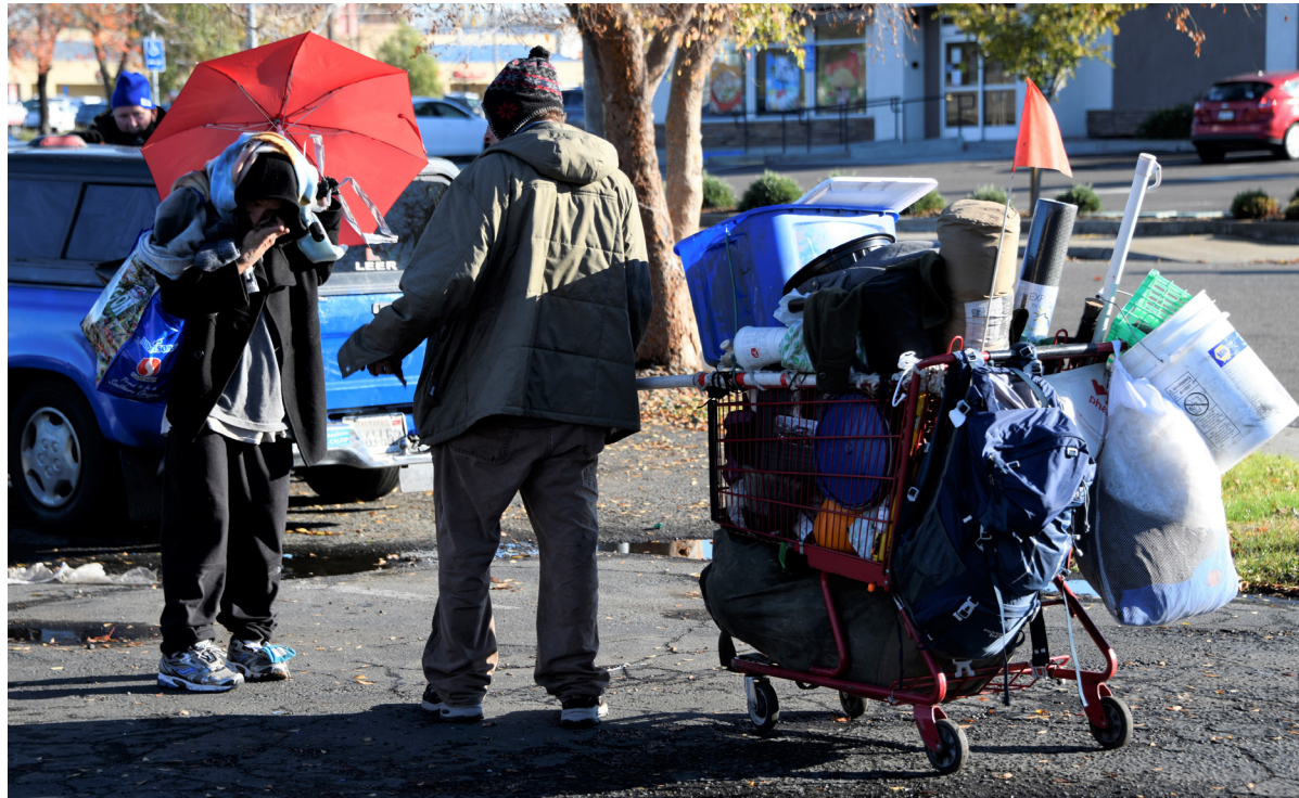
Poverty and Hunger in Sacramento, CA. Food distribution by Eventide Community.

They pressed into service a passer-by, Simon, a Cyrenian, who was coming in from the country, the father of Alexander and Rufus, to carry his cross.