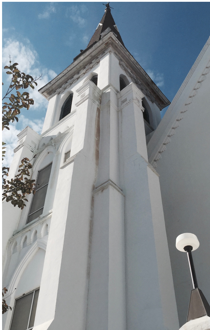
Mother Emanuel AME church, the site of the shooting and murder of nine church members during a bible study. Photo taken during a Presbyterian Disaster Assistance Mission Trip to the flooding in Charleston, South Carolina.

When day came the council of elders of the people met, both chief priests and scribes, and they brought him before their Sanhedrin. They said, "If you are the Messiah, tell us," but he replied to them, "If I tell you, you will not believe, and if I question, you will not respond. But from this time on the Son of Man will be seated at the right hand of the power of God." They all asked, "Are you then the Son of God?" He replied to them, "You say that I am." Then they said, "What further need have we for testimony? We have heard it from his own mouth."