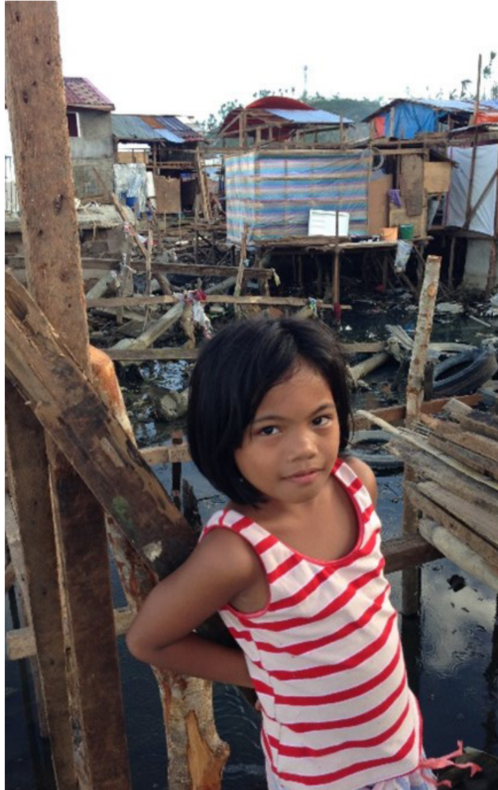
In the aftermath of the destruction of Hurricane Yolanda in Tacloban, Philippines. A mission trip sponsored by Hayward Presbyterian Church.