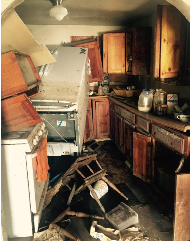
Photo of a flooded family home, the day before it was demolished. Presbyterian Disaster Assistance Mission Trip Beaumont, Texas.

Then Jesus came with them to a place called Gethsemane, and he said to his disciples, “Sit here while I go over there and pray.” He took along Peter and the two sons of Zebedee and began to feel sorrow and distress. Then he said to them, “My soul is sorrowful even to death. Remain here and keep watch with me.” He advanced a little and fell prostrate in prayer, saying, “My Father, if it is possible, let this cup pass from me; yet, not as I will, but as you will.” When he returned to his disciples, he found them asleep. He said to Peter, “So you could not keep watch with me for one hour? Watch and pray that you may not undergo the test. The spirit is willing, but the flesh is weak.”